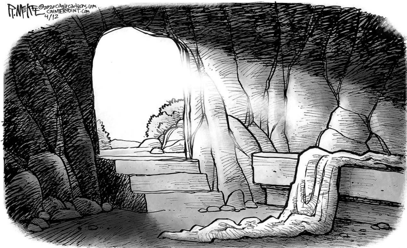
The LIGHT at the END of the TUNNEL